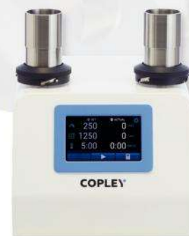
JV 200i with Method 3 platform

Acoustic Cabinet reduces the noise level produced by the JVi series unit